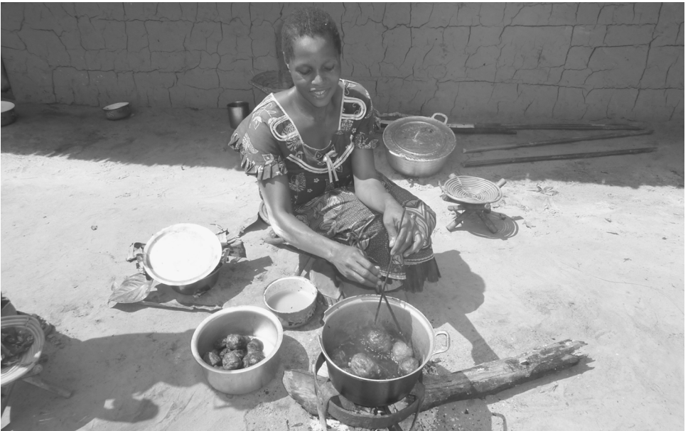
Beignets being sold by a street vendor in the Democratic Republic of Congo.

Although there is no tradition of restaurant culture in Central Africa, street food is omnipresent and has a long history, dating back to at least several centuries. When Europeans first landed on Central African shores at the end of the 15th century, they encountered an active trading system with many local markets. On these markets, provisions ready for consumption could be bought. Chikwangué , for instance, was reported to be sold in 1698 at markets around Malebo Pool, a widening of the Congo River that separates the current capitals of the Republic of the Congo and the Democratic Republic of the Congo (DRC). Central Africa is a large geographical area that includes Cameroon, Gabon, Equatorial Guinea, the DRC, and the Republic of the Congo. Most of the mentioned countries border the equatorial rain forest, home to a highly diversified fauna and flora and crisscrossed by numerous waterways, of which the Congo River is the most important. In the era of colonization, most of Central Africa was French territory, still to be seen in numerous